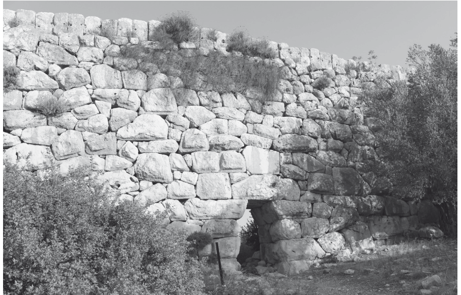
Figure 8. Polygonal wall supporting the Delikkemer inverted siphon

close water sources since Lycian cities had procured their water without aqueducts for centuries. Rather, it is possible to associate this need with the changes in daily life, particularly with the introduction of Roman bathing habits, a cornerstone of Roman culture. A vast amount of clean water had to be supplied to the cities due to high water consumption in the baths. The earliest datable bath building is found in Patara ( Figure 9 ) ( Figure 10 ) and dated to the time of Nero; whose name was later replaced by that of Vespasian in the dedicatory inscription (Eck, 2008). Similar to the restoration of the Patara aqueduct, the construction of the building, now called Nero/Vespasian baths, was supervised by Sextus Marcius Priscus and funded both by the League and imperial benefaction (Eck, 2008). The baths may have been planned together with or shortly after the aqueduct, suggesting that both building types were introduced to Lycia almost concomitantly following the annexation.