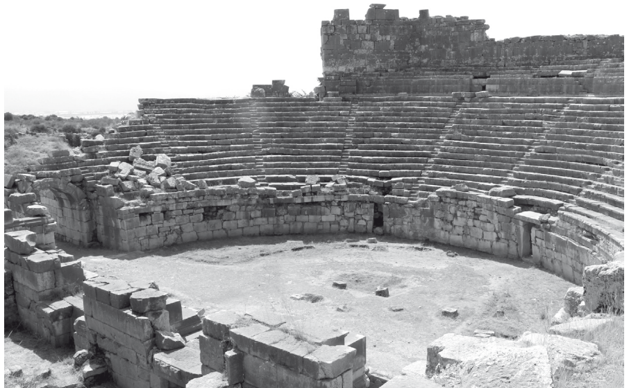
Figure 20. Theatre at Xanthos