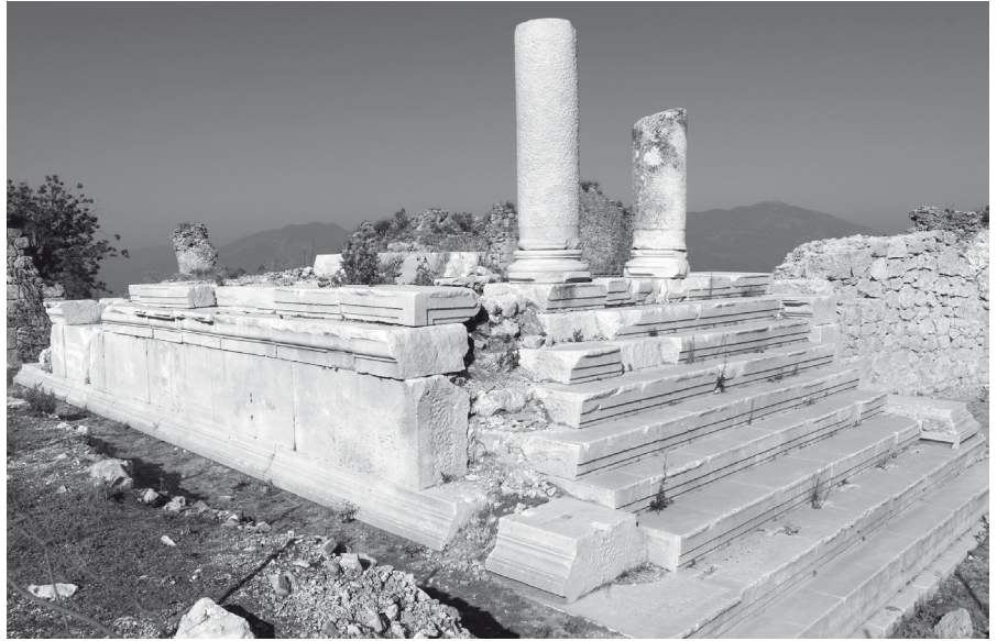
Figure 14. Temple of Kronos at Tlos