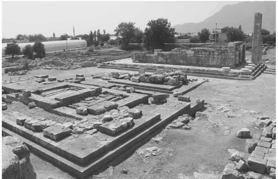
Figure 6. Temples of Apollo, Artemis and Leto at Letoon (from left to right)

relics inside the new temples as their aforementioned foundations can still be observed (des Courtils, 2003, 143).