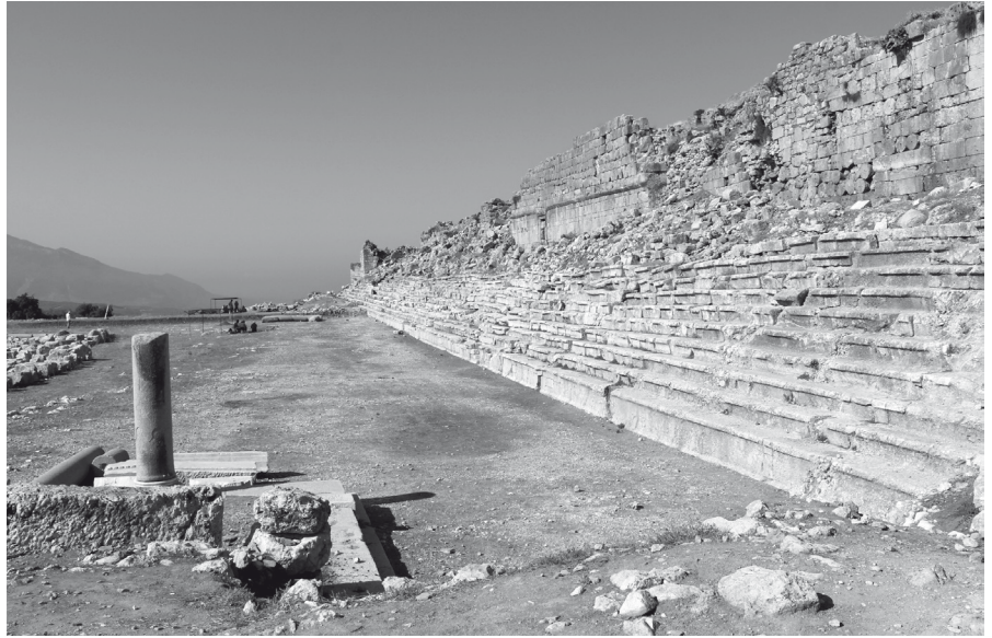
Figure 5. Stadion at Tlos