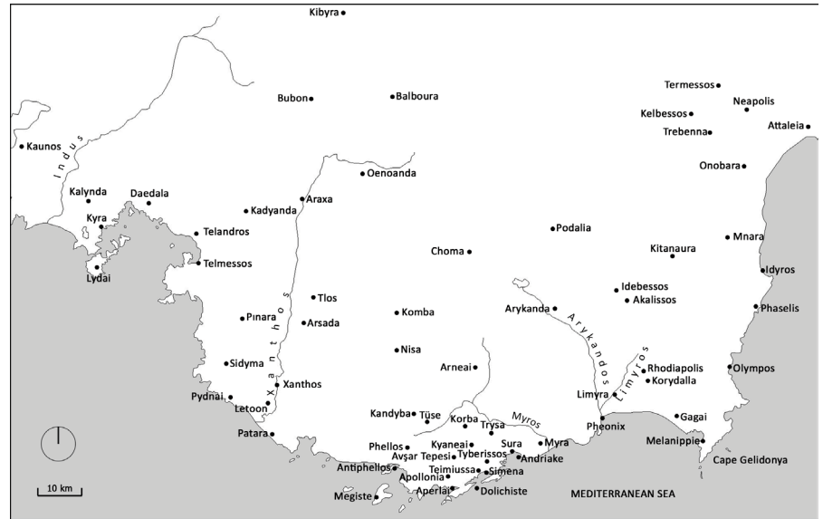
Figure 1. Map of Lycia (All figures in this paper belong to the author unless stated otherwise)

2. Modern archaeological studies in Lycia began in 1950 and intensified after the 1980s. For lists of official archaeological excavations and surveys conducted between 2006-2021, see the website of the Directorate General of Cultural Assets and Museums https://kvmgm.ktb.gov.tr/ . For a list of older studies, see Çevik (2015, 14-5). Several Lycian cities have been under intense scholarly scrutiny for several decades now, which has resulted in a wide range of publications. A large part of this scholarly corpus concerns the architectural remains in city centers, which enables an examination of architectural continuities and changes in the Lycian cities along the centuries, even though the level of accessibility of information collected from each city is not equal. Field surveys were conducted in Lycia by the author in 2014 and 2016 for on-site observations and photographing the architectural remains.