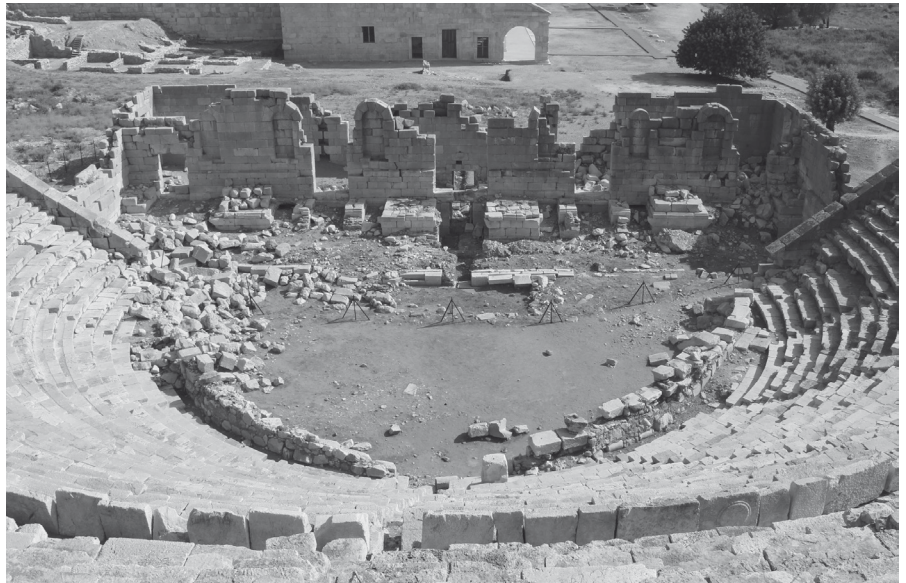
Figure 19. Theatre at Patara