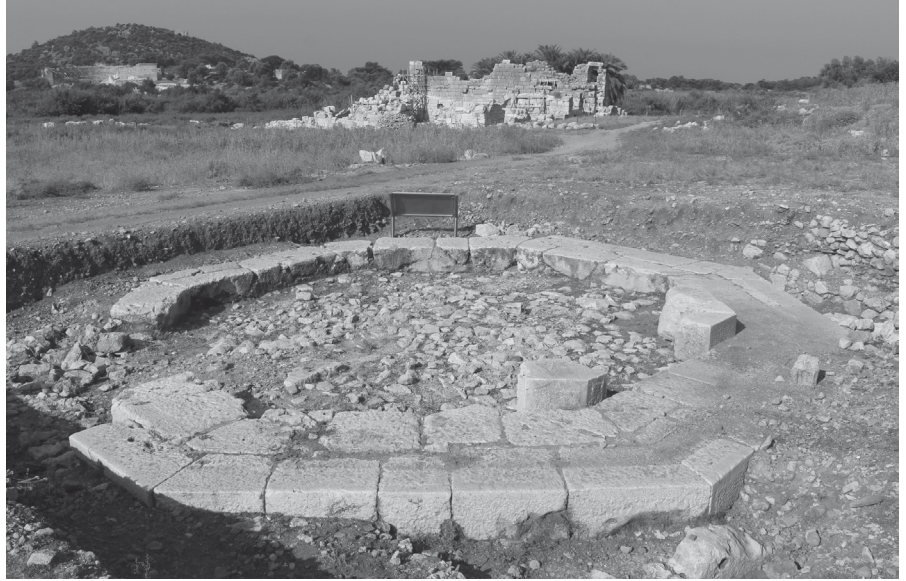
Figure 22. Octagonal pool at Patara