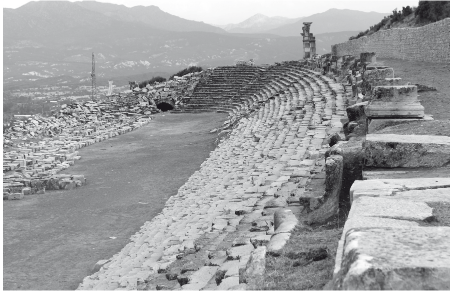
Figure 21. Stadium at Kibyra