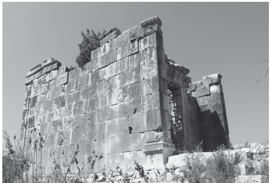
Figure 13. Corinthian temple at Patara

Another impact of Roman architecture on a religious context is the introduction of the Roman podium temple. The earliest example currently stands as the sebasteion at Sidyma, suggesting that the building type first entered Lycia with the annexation. Like the rest of Asia Minor, this temple form became common in the region. The well-preserved examples include the Corinthian temple at Patara, the temple of Kronos at Tlos, and the temple of Asklepios and Hygieia at Rhodiapolis, all dated to the 2 nd century CE (Figure 13) (Figure 14) (Figure 15). Among them, the temple at Rhodiapolis which was also dedicated to the Sebasteoi (emperors), was built by Herakleitos, a physician, poet, and writer of medical works (TAM II 910) (Figure 15). Approximately in the same period, the form of this temple type began to be utilized for temple-tombs by wealthy citizens. Apart from their monumentality, many of the surviving temple-tombs stand out for having been built within the settlement areas. Even though the intramural burial of heroic figures was acknowledged in Greek and Roman societies, it was prohibited for ordinary people. Yet, the Lycian elite seems to have