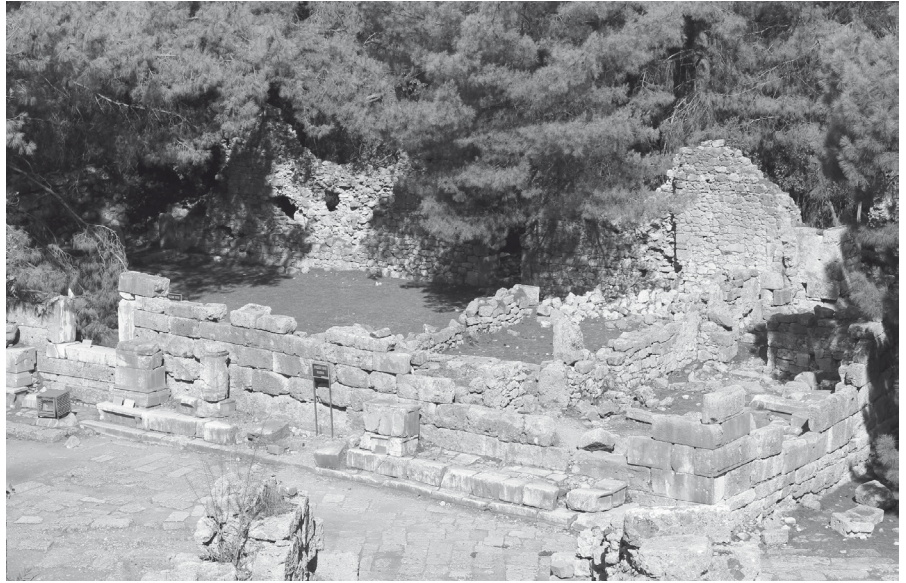
Figure 17. Tetragonal Agora at Phaselis

modified the spatial, social, and political dynamics within the Lycian agorae .