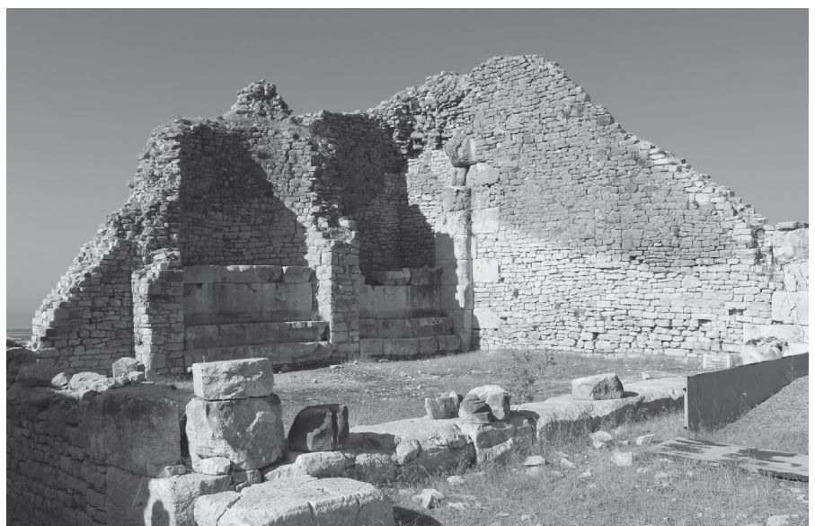
Figure 12. Hadrianeum at Rhodiapolis