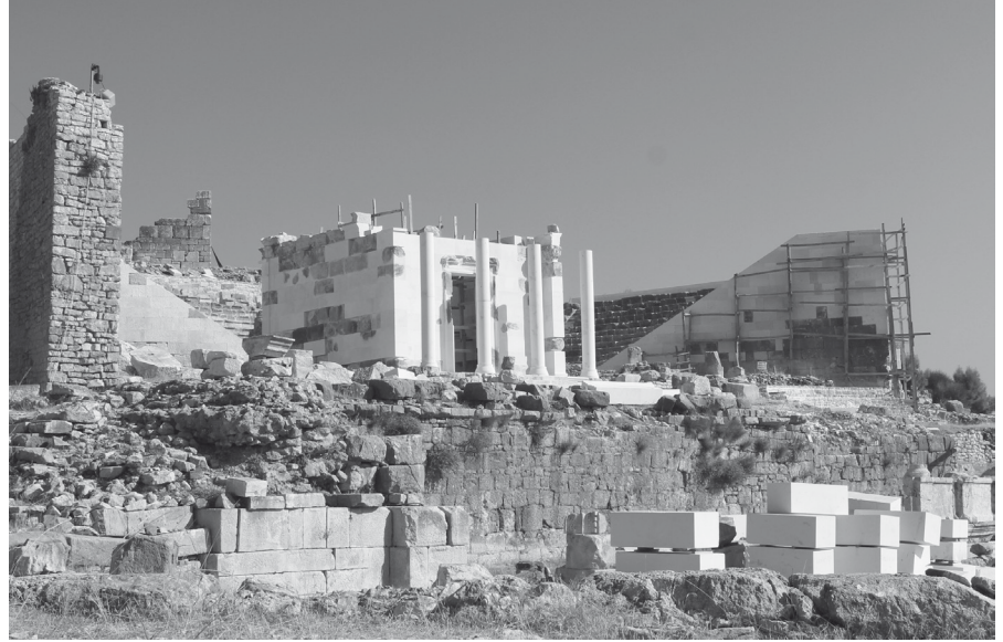
Figure 16. Agora of Rhodiapolis and the temple-tomb of Opramoas

theater was financed in Hadrianic times by Tiberius Claudius Flavianus Eudemus, a wealthy local (Piesker and Ganzert, 2012, 219-25). The rarity of this building type in the East suggests that it took inspiration from the west.