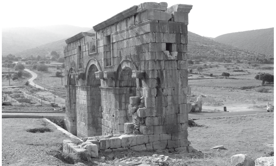
Figure 23. Arch of Mettius Modestus at Patara

construction techniques with Roman technology, continuing early practices like intramural burial using Roman building types are some prominent examples of how the architecture of the period was distinctively shaped. Architectural and urban decisions made during this period demonstrate the selective adoption of Roman architectural elements, the balancing of old and new architectural practices and the creation of a provincial architectural language.