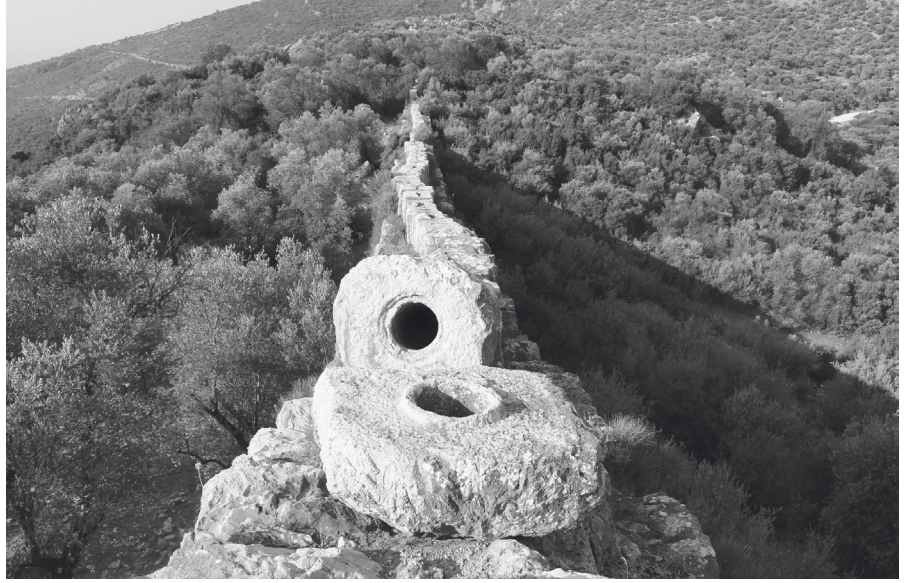
Figure 7. Delikkemer inverted siphon of the Patara aqueduct