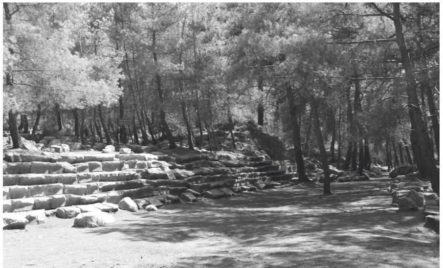
Figure 4. Stadiion at Kadyanda

The impact of Hellenistic influence on religious architecture also became prominent as Hellenistic temples were built in several cities such as Antiphellos, Arykanda, Sura and Limyra (12). This era also witnessed the refurbishing of the sanctuary of Letoon which included the replacement of the dynastic period temples of Leto, Artemis and Apollo with Hellenistic temples in Ionic, Corinthian and Doric orders respectively (Figure 6), the construction of a false grotto for the deities of the sacred spring, a theatre, a propylon (monumental gateway) and porticoes (des Courtils, 2009; Le Roy, 1991). The remains of the dynastic temples may have been preserved, as