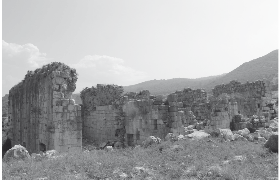
Figure 9. Nero/Vespasian baths at Patara