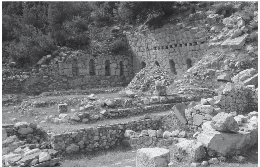
Figure 11. Traianum at Arykanda

Following the endorsement of the emperor worship by Claudius, the number of sebasteia increased in several cities in the following centuries. The Sebasteion at Bubon, Sebasteion and Traianum at Arykanda and Hadrianeum at Rhodiapolis can be given as well-preserved examples (Figure 11) (Figure 12). Epigraphic records indicate that Patara, Akalissos, and Oenoanda received the honorific title of neokoros , the permit to organize imperial festivals and build a provincial imperial temple, although no trace of temples has been discovered thus far (Burrell, 2004, 254-6; Milner, 2015). According to Burrell (2004, 256), minor cities like Akalissos and Oenoanda could have acquired this title only after major cities like Patara received it at least twice, which means that several