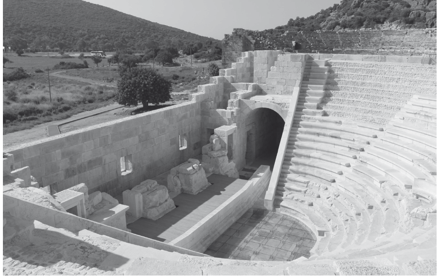
Figure 3. Bouleuterion at Patara