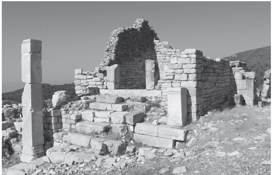
Figure 15. Temple of Asklepios and Hygieia at Rhodiapolis

continued the early Lycian tradition of the burial of the aristocratic class within the city, replacing the architectural form of the Greek temple with that of the Roman podium temple (Işık, 1995). The temple-tomb of Opramoas, a great benefactor of the 2 nd century CE, built inside the agora of Rhodiapolis, stands out as a striking example of this tradition (Figure 16) (Çevik, 2015, 434-6). Moreover, the intramural temple-tombs at Patara, mostly dated to the 3 rd century CE, draw attention with their increased dimensions and elaborate decorations (Işık, 1995).