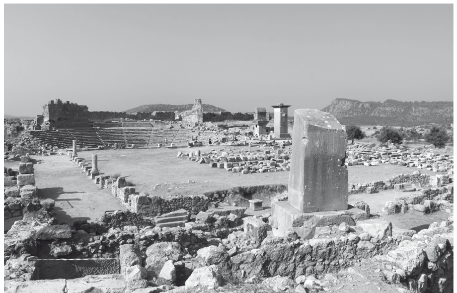
Figure 2. Western Agora and Lycian tombs at Xanthos

Letoon, the federal sanctuary of Lycia under the jurisdiction of Xanthos, was used as a sacred space since at least the 6 th century BCE. It was dedicated to Leto and her twins Artemis and Apollo, and had a sacred spring dedicated to Elyanas, the Lycian equivalents of Nymphs. In the late 5 th or early 4 th century BCE, three temples were built for each deity, most probably by the Xanthian dynast Arbinas (Le Roy, 1991). Although these temples were replaced in the Hellenistic Period, their foundations can still be observed. The remaining post holes and grooves carved into the bedrock indicate that the upper structures were made of timber, a common