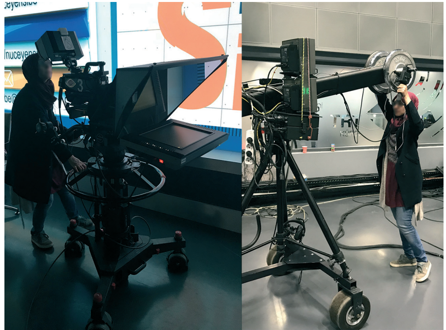
Figure 3. Camera operation as skilled practice.

User and product are not only intertwined in the former's experience, but also co-shaped in practice. Following Aktaş's insights, they are in a constant "dialogue," which makes the process ever dynamic. Gürtekin's findings reveal that an experienced camera operator executes smoother camera movements than a novice, whereas a tripod limits the movements of the camera more than a pneumatic pedestal does. In that regard, the camera and other technical equipment are not mere objects manipulated by the operator for producing a desired image; they are the active participants of an embodiment process, as the result of which the visual image is co-created.