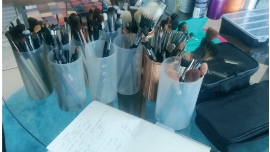
Figure 2. Make-up tools used by the artist.

different formulas, chemical states, and pigmentation levels. Furthermore, the properties of a product such as color, texture, fluidity, and opaqueness may appear on the skin unlike how they seem on the pan. Make-up tools, such as brushes, sponges, even tweezers, also have specific uses in combination with specific materials, and diverse ways to apply them – e.g., angles, lines, pressure, or repetitions. An example is the fan brush, which is used to highlight higher points on the face such as cheekbones. However, the artist that Tok observed used it to contour the hollows of the cheeks, to darken the shadows. He pointed out that, when his fellow make-up artist had recommended this “make-up trick”, he had not been convinced at all, but was surprised when he experienced it. Thus, the recognition of the purpose of a tool and its mode of operation can also be interpreted as an extended cognitive process.