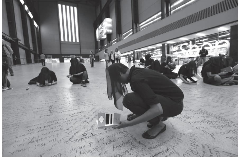
Figure 4. Liberate Tate, Time Piece , June 2015, performance at Tate Modern

As these natural processes constantly change the appearance of a plexiglass cube with a small amount of water in it, the climate-controlled environment of the gallery and its function of the conservation of artworks to maintain their market value become fully visible (10). While directly related to these pieces, Liberate Tate's Floe Piece simultaneously brings to our attention how, due to global warming and climate change, economic interests and global operations of multinational corporations are now directly implicated in a formerly mundane process, that is the melting of ice.