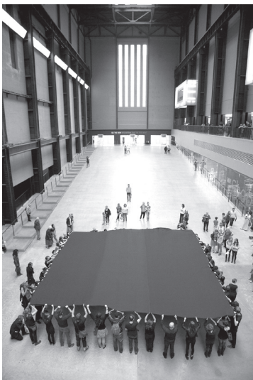
Figure 2. Liberate Tate, Sunflower , September 2010, performance at Tate Modern