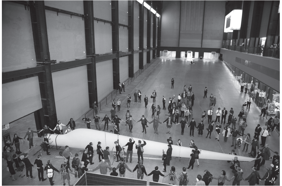
Figure 3. Liberate Tate, The Gift , July 2012, performance at Tate Modern

“On one level, the articulation entails finding a language for protest, the vocalization, the verbalization, or the visualization of political protest. On another level, however, the articulation also shapes the structure or internal organization of protest movements.” In Liberate Tate’s case, the visually horizontal articulation of the protest materializes the organizational form of the group as a heterogeneous yet equalitarian network that opposes the top down capture of the Turbine Hall by the corporate rhetoric.