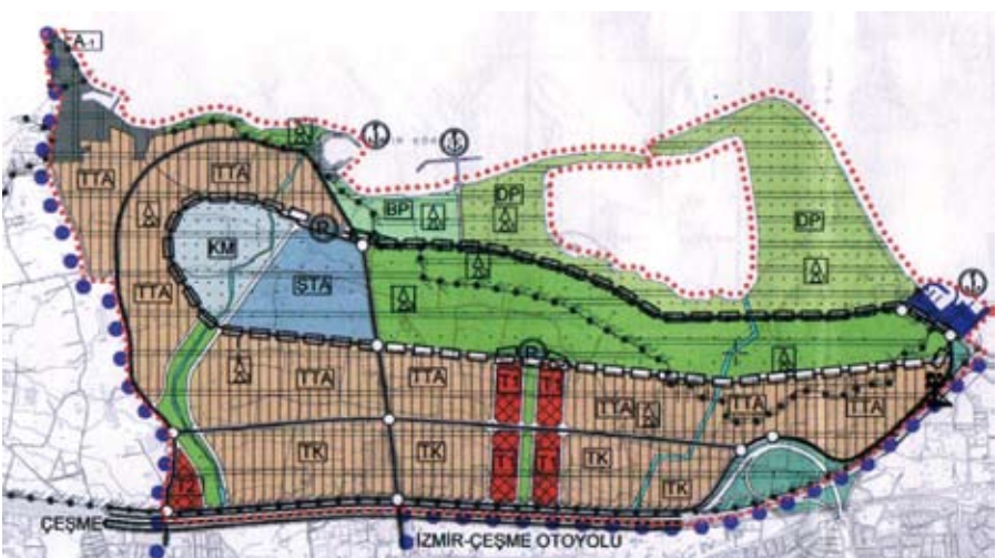
Figure 3. Inciralti Tourism Center Development Plan, prepared in 2011 but not implemented yet. Source: KTB (2011)