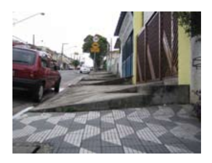
Figure 10. Public Private appropriation of Urban Space. Rua Paulo Avelar, São Paulo, Brazil.

occupy and inscribe a new use. Appropriation of empty spaces opens new trajectories of use, like De Certeau's tactics of walking.