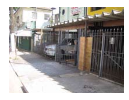
Figure 9. Public Private negotiation of Urban Space. Ave Cons Rodrigues Alves São Paulo Brazil.