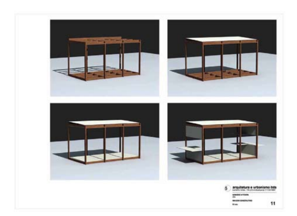
Figure 5. Digital drawing of Nomadic Kitchen by Group 5/Obra, 2005.

based on the workshop material and maquettes. Acknowledging the limitation of space, it was proposed to locate the kitchen and temporary garden on the roof of the one storey two-bedroom house. This would utilise the limited space and symbolically bring a new visibility to the project and to the public image of Nova União de Arte and the surrounding community. By situating the Nomadic Kitchen on the roof creates a public visibility that ruptures and registers a break with the ordinary function of people and place.