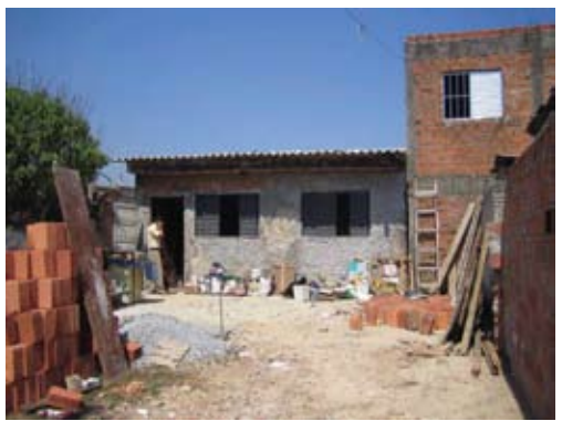
Figure 6. Mutuãrio, collective building action Nomadic Kitchen Vila Nova, São Miguel, Brazil, Photo: Mick O'Kelly, 2006.

The Mutuārio is collective assemblage of urban building where the community synchronizes their desires, energies, passions and expenditure towards a collective action. This collective action is central to the idea of community where the collective good is served by individual need. The Nomadic Kitchen was constructed with Mutuārio collaboration and support, by the NGO team and local residents. This process of building and extending onto existing informal urban structures is common practice for families in need of additional space. This is an art/architecture of urgency