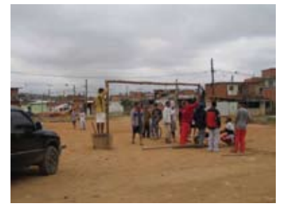
Figure 8. Appropriation of Space and roundtable meetings in Nomadic Kitchen in Vila Nova São Miguel, Brazil, Photo: Mick O'Kelly, 2006.