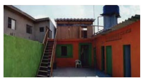
Figure 7. Nomadic Kitchen Front and Rear View, Vila Nova, São Miguel, Brazil. Photo: Mick O'Kelly, 2006.

whose interstitial aesthetic is based on improvisation and appropriation. This labour is an economy of reciprocity between neighbours ( Figure 6 ).