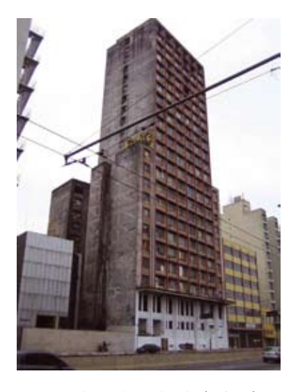
Figure 13. Prestes Maia, São Paulo, Brazil.

This offers new networks of migratory trading practices that are interstitial economies of survival. There are thousands of such vendor ambulante , camelôs operating across São Paulo. Their strategies of survival draws attention to formal economies and their tactical counter response through black market trading and shadow economies, in the process their spatial tactics revitalize the street and the future dynamic of the city. These urban trading practices highlight the tensions between the regulated and unregulated flows of people, consummerables and capital. In conditions of indeterminacy such practices operate on a larger scale across geo-political economies worldwide.