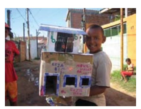
Figure 4. Nomadic Kitchen Workshops in Vila Nova, São Miguel, Brazil. Photo: Mick O'Kelly, 2006.

resourcefulness beyond the immediate situation. What kinds of knowledge, methods and tools empower non-analytical approaches to urban desire? In July 2005 I ran a series of workshops with residents and participants living in Vila Nova. Participants on the workshops include parents, children, teenagers and the NGO team who organise NUA. From these workshops emerged an individual and collective visual aesthetic for what Nomadic Kitchen would become and an aggregate of desire for a new imagined urbanism. Through drawings and maquettes a bricolage (13) of collective imagination made visible this aggregate of collective desiring. The workshops developed and revealed an imaginative vision between the participant groups and the artist. This explorative strategy found an aesthetic creative process that looks to multiple possibilities for a nomadic urban structure (Figure 4).