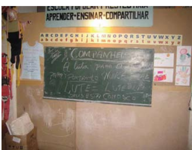
Figure 14. Library and literacy classroom in Prestes Maia Favela, São Paulo.